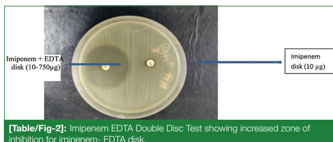
[Table/Fig-2]: Imipenem EDTA Double Disk Test showing increased zone of inhibition for imipenem-EDTA disk.

All the carbapenem-resistant isolates were subjected to the double disk synergy test using Imipenem and EDTA. To prepare a 0.5 McFarland standard of the test isolate, 2 to 3 colonies of the test isolate were inoculated into peptone water and incubated for 2-3 hours at 37°C. After incubation, a lawn culture of the organism was inoculated onto MHA following the CLSI guidelines. A sterile cotton swab was then dipped into the 0.5 McFarland standard inoculum and streaked across the entire MHA plate. After drying, a 10 µg imipenem disc was placed on the lawn culture, maintaining a distance of 24 mm center to center from the imipenem-EDTA (10-750 µg) disc. The plate was then incubated at 35±2°C for 16 to 18 hours. The zone diameter was measured using a calibrated zone scale. A MBL positive strain was considered when the increase in the inhibition zone with the imipenem-EDTA disk was ≥7 mm compared to the imipenem disk alone [10]. [Table/Fig 2] shows the DDT.