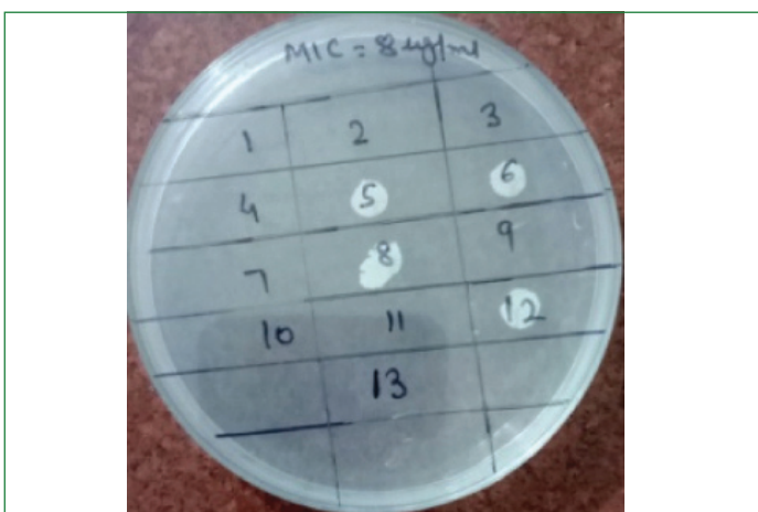
[Table/Fig-3]: Vancomycin agar dilution method with \text{MIC} 8 \mu\text{g}/\text{mL} .