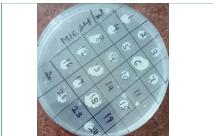
[Table/Fig-2]: Vancomycin agar dilution method with \text{MIC} 2 \mu\text{g}/\text{mL} .

of 0.5, 1, 2, 4, 8, 16 and 32 \mu\text{g}/\text{mL} were prepared in house using vancomycin powder in pure form (obtained from Sigma-Aldrich, India). After dividing the plates in multiple quadrants, 0.5 McFarland bacterial suspensions were inoculated onto these plates with the help of micropipette. First all resistant strains were tested for MIC of 0.5, 1 and 2. Strains with \text{MIC} > 2 \mu\text{g}/\text{mL} were tested for higher MIC i.e., 4, 8, 16 and 32 \mu\text{g}/\text{mL} . S. aureus ATCC 25923 was included in all the test plates as control organisms. Plates were incubated at 35^\circ\text{C} for 24 hour. Each spot was noted for the presence of growth or no growth. The least concentration of antibiotic that was able to inhibit visible growth of the organism was taken as MIC of that strain. Vancomycin \text{MIC} < 2 \mu\text{g}/\text{mL} reported as sensitive, \text{MIC} 4-8 \mu\text{g}/\text{mL} reported as VISA and \text{MIC} > 16 \mu\text{g}/\text{mL} reported as VRSA [Table/Fig-2-4] [5].