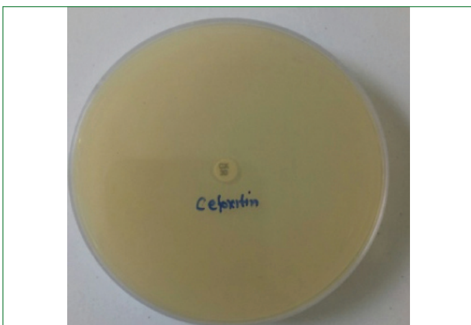
[Table/Fig-1]: Cefoxitin screen test positive (MRSA).

of 0.5, 1, 2, 4, 8, 16 and 32 \mu\text{g}/\text{mL} were prepared in house using vancomycin powder in pure form (obtained from Sigma-Aldrich, India). After dividing the plates in multiple quadrants, 0.5 McFarland bacterial suspensions were inoculated onto these plates with the help of micropipette. First all resistant strains were tested for MIC of 0.5, 1 and 2. Strains with \text{MIC} > 2 \mu\text{g}/\text{mL} were tested for higher MIC i.e., 4, 8, 16 and 32 \mu\text{g}/\text{mL} . S. aureus ATCC 25923 was included in all the test plates as control organisms. Plates were incubated at 35^\circ\text{C} for 24 hour. Each spot was noted for the presence of growth or no growth. The least concentration of antibiotic that was able to inhibit visible growth of the organism was taken as MIC of that strain. Vancomycin \text{MIC} < 2 \mu\text{g}/\text{mL} reported as sensitive, \text{MIC} 4-8 \mu\text{g}/\text{mL} reported as VISA and \text{MIC} > 16 \mu\text{g}/\text{mL} reported as VRSA [Table/Fig-2-4] [5].