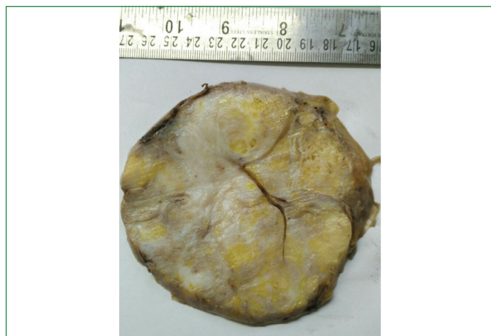
[Table/Fig-1]: Gross-encapsulated well circumscribed mass, cut section grey white with yellowish areas.